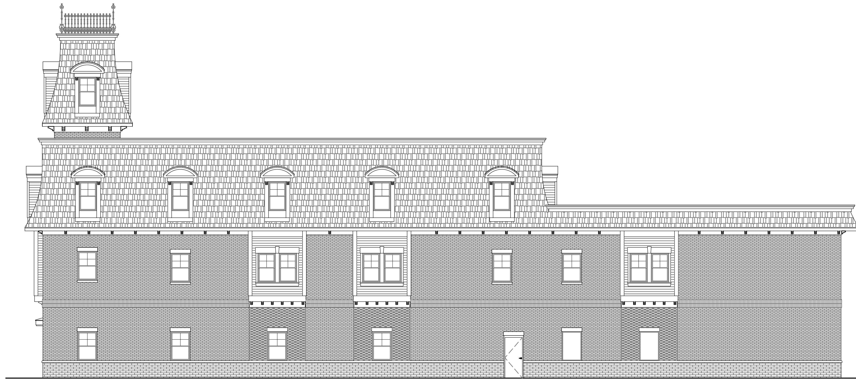
4 A-2 RIGHT SIDE ELEVATION SCALE: 1/8" = 1'-0"