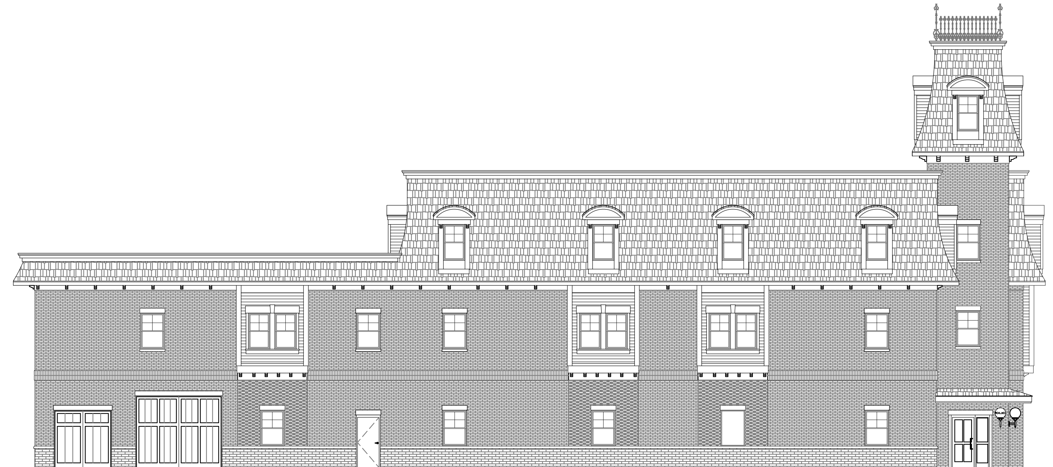
2 A-2 LEFT SIDE (ST. JOHN'S ST.) ELEVATION SCALE: 1/8" = 1'-0"

Robbie Conley Architect, LLC 596 Glassboro Road Woodbury Heights, New Jersey, 08097 (856)-845-7500 FAX:(856)-853-0528 N.J. LIC. NO. 21AC0069700 NCARB CERT. NO. 52314 P.A. LIC. NO. AX004265L